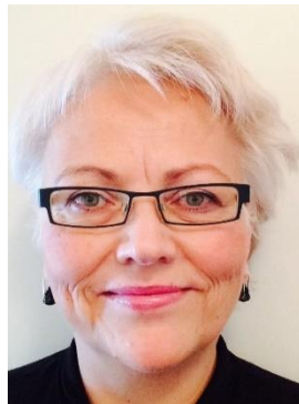
Terje Peetso European Commission